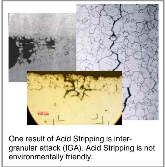
One result of Acid Stripping is intergranular attack (IGA). Acid Stripping is not environmentally friendly.

Acid requires masking to avoid removing the internal coatings, and subsequent unmasking. That is expensive and adds no value. A poor mask can destroy internals and scrap the part. The acid stripping process is a batch lot process and it is not unusual to find a group of Industrial Gas Turbine (IGT) parts being damaged due to acid variability.